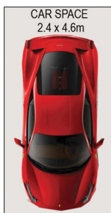
CAR SPACE 2.4 x 4.6m