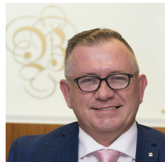
Pelham Marsh 3169 0230

A magnificent, light, bright and airy, spacious and practical designed home, with beautiful modern fixtures and features, a family considered very well laid out floorplan. This home would be ideal for a family looking for somewhere lovely to live, somewhere that they need a separation of spaces to create a harmonic home, one that is also convenient and close to major shopping, public transport and a great selection of primary and high schools. Within a 5 min drive to the water front and only a 2 minute