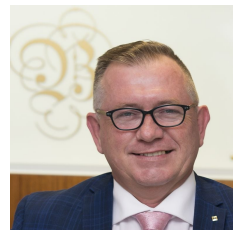
Pelham Marsh 3169 0230

Both bedrooms offer robes and the master has an ensuite. Polished porcelain tiles line the halls, the living room and the kitchen, with rich dark high end carpet to the bedrooms, two beautiful bathrooms and the extra fully covered deck offers a great space for a home gymnasium or great outdoor theater, truly an awesome space not very often included. Single car accommodation with a secured lock