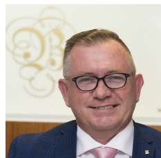
Pelham Marsh 3169 0230

Building Size : 117 sqm Land Size : 930 sqm View : https://www.brisbaneboutique.com/lease/qld/southside/carina/residential/house/6262789