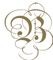
Rentals Department. 31690200