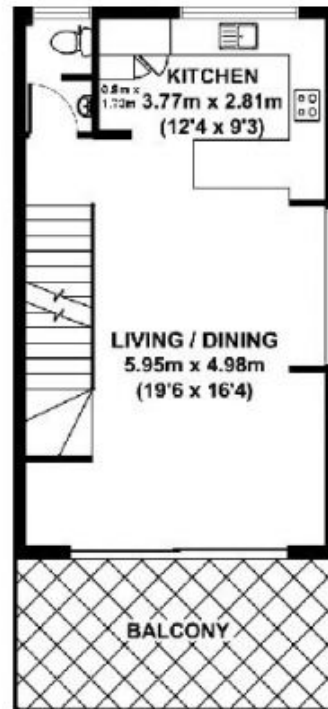
MIDDLE LEVEL GROSS INTERNAL FLOOR AREA 43 SQ M