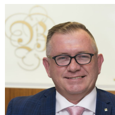
Pelham Marsh 3169 0230

Quite unique in design, A good size courtyard that is designed to be easy to maintain. Very convenient position.